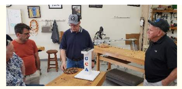
Guild members discussing challenges at the May Benchtop Challenge at Woodcraft.