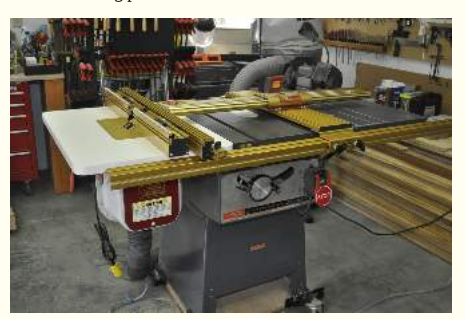
70's Craftsman Table Saw Outfitted With Incra TS/LS Rip System, Incra Router Table, Incra Clean Sweep & Incra Wonder Fence

When I built the shop I had my table saw, band saw, jointer and drill press. I later on traded the table top drill press in for a floor standing drill press, added a 15" surface planer, a big spindle sander with a 24" x 24" cast iron top, Jet 12" compound miter saw and a wood lathe. All of the tools are on wheels except the drill press and wood lathe. My table saw, band saw, jointer and drill press are Craftsman models from the early 70's. While wishing for a Saw Stop to replace my Craftsman table saw, I got caught up in the great recession and was laid off. So went the Saw Stop so I upgraded the table saw to include an Incra TS/LS fence system. Best decision I ever made. I also replaced one of the wings on the table saw with an Incra routing table, an Incra Clean Sweep to vacuum up the dust and an Incra Wonder Fence. Having the router as part of the table saw saved me a lot of space. Without the router being part of the table saw I would have to have an extra router table running around the shop.