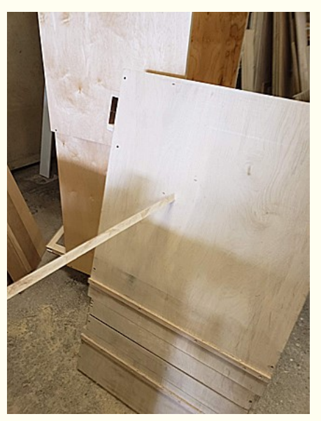
Maple From Kickback Imbedded In Plywood

We knew that the cut piece was going to fly, and we prepared for the flight by placing our large sliding cutoff table four feet away to stop the cutoffs. Andy was at the saw, standing to the left of the blade. Cutting the plywood sides went as expected. As soon as the blade completed the miter, the piece flew and bounced off the plywood cutoff table, falling harmlessly to the floor.