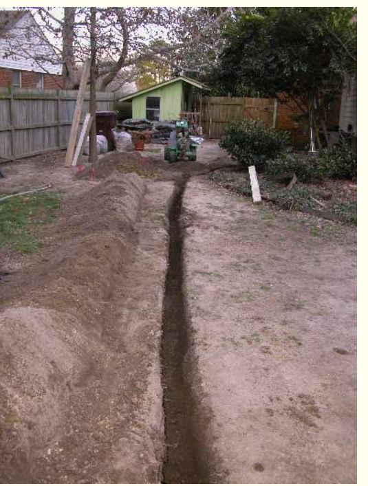
PTAC Heat Pump (Left) Shown During Installation. Right - Trench For Electricity, Cable & Phone Shown During Construction

There are two work surfaces. I have the traditional work bench that is 2' x 8' with a 2 ¼" butcher block top. I also utilized a simple 2" x 4" frame work with a laminate top structure that I got from the big box stores. This allowed me storage room under the top for three rolling tool cabinets, a shop vac and air compressor.