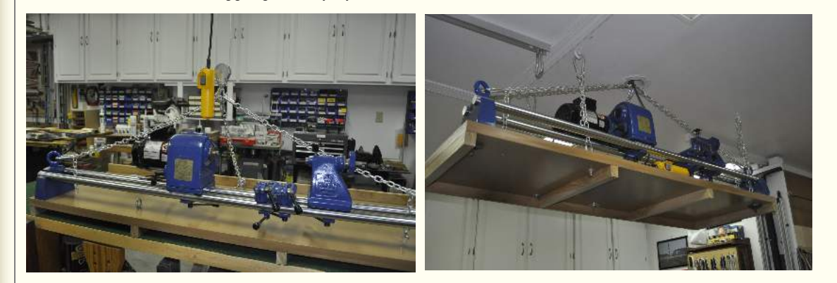
Views Of Record Power Lathe On Work Bench (Left) & Hanging From Celling To Save Space

I later acquired a Record Power lathe from a gentleman down in the Outer Banks. It was a great deal and included all of the hand tools, vices and even a new Rikon grinder still new in the box. Problem was where to put it. With the help of Don Newsome of the guild we came up with an ingenious solution to this problem. I built a new table top for the lathe and attached the lathe to it and put it on a cable wench located up in the attic of my shop. When not using the lathe, I grab hold of the lift mechanism and hoist the lathe to the ceiling getting it out of my way!