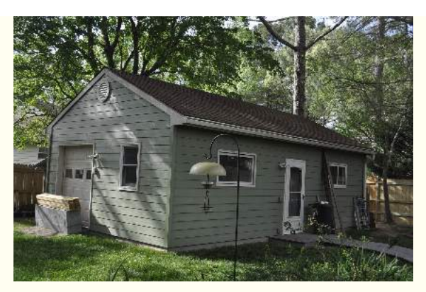
Gary's 18' x 30' Workshop He Built With Help From Friends

Gary completed his detached work shop in October of 2008. It is 18' x 30' with 9' high ceilings. It is heated and air-conditioned using a PTAC ( P ackaged Terminal A ir C onditioner) heat pump unit. You see these units in hotel rooms. They are very cost effective. For electricity I "borrowed" 100 Amps from the house panel. This kept me from having to have Dominion put in a separate line. While laying the electrical cable in the trench from the house to the shop I also ran coax for my Verizon TV connection along with a dedicated land line for the phone. The shop is now equipped with WIFI via the electrical system.