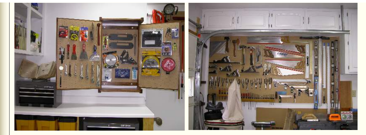
Peg Board Storage. Note The White Kitchen Contact Paper Outlining The Tool Location

I later on added a metal roof lean too to the back of the shop to dry fresh cut lumber. It works out very well