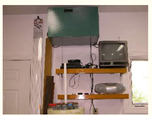
Grizzley Air Filtration System (Green Box)

While I do not have a central vac system in the shop I do have an air filtration by Grizzley and a large Rikon vac system equipped with a nice canister filter. Does a great job with the dust.